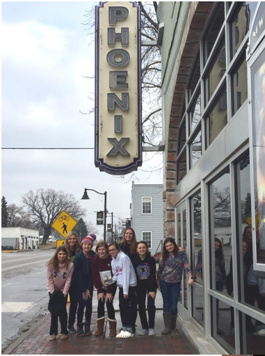
Youth group spent an afternoon hosting "God's Not Dead" at the Phoenix Movie Theatre in Neola.