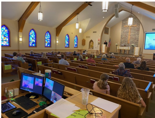
Pictured: Worship service on June 7th, 2020

301 N. Chestnut St. AVOCA, IA 712-343-2518