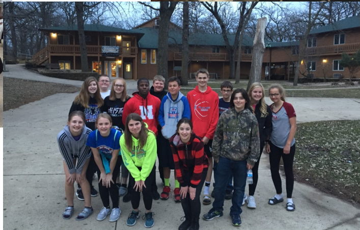
Okoboji Recharge Camp!