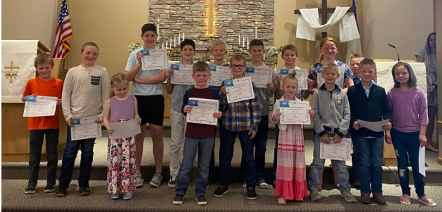
17 Sunday School Children were awarded Attendance Awards this year!