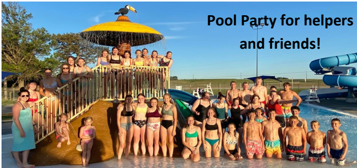
Pool Party for helpers and friends!